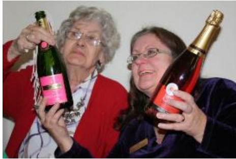
Pickles and mincemeat...