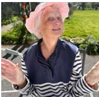
Sunny days at Coppelia - on page 3