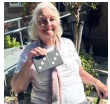
Garden games at Plymbridge - on page 6