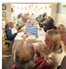
Buffet lunch at Bramble Down