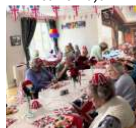
Red, white and blue at Cornerways