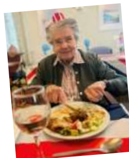
Tucking in at Coppelia House

We got creative in the lead up to VE Day, making our own bunting and other decorations. On the day, we celebrated with friends and family, enjoying food, games and music together.