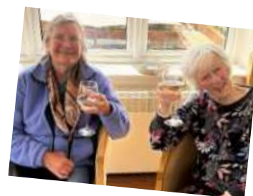
Raising a glass at Parkland