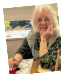
VE Day prep at Plymbridge