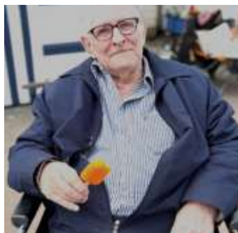
Air Show views at Cornerways - on page 4