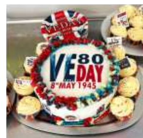
Beautiful cake at Cornerways