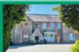
Parkland House Residential Home Exeter 01392 251144