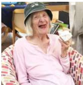
Indoor beach at Parkland - on page 5